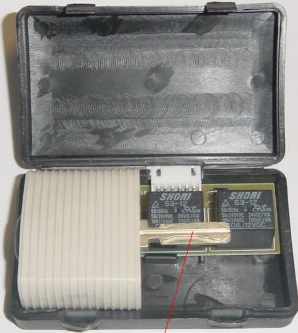
KEY INSERTED INTO COIL